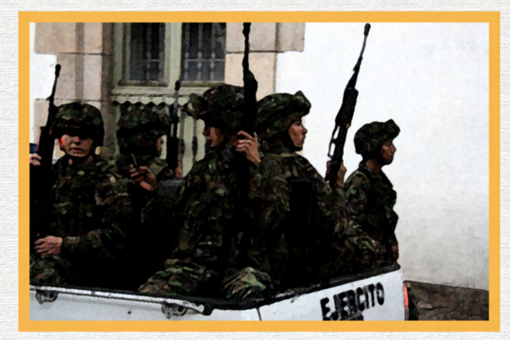
Militarized police unit in Zipaquira, Colombia

found that police officers who were veterans were more likely to fire their weapons than non-veteran officers. Historically, the U.S. has needlessly drawn on expressions of war— "the war on terror" and "the war on drugs"—to shape U.S. foreign and domestic policy. The same "rules-based order" with which the U.S. applies its foreign policies globally engenders an orientation towards aggressive and militaristic policing domestically.